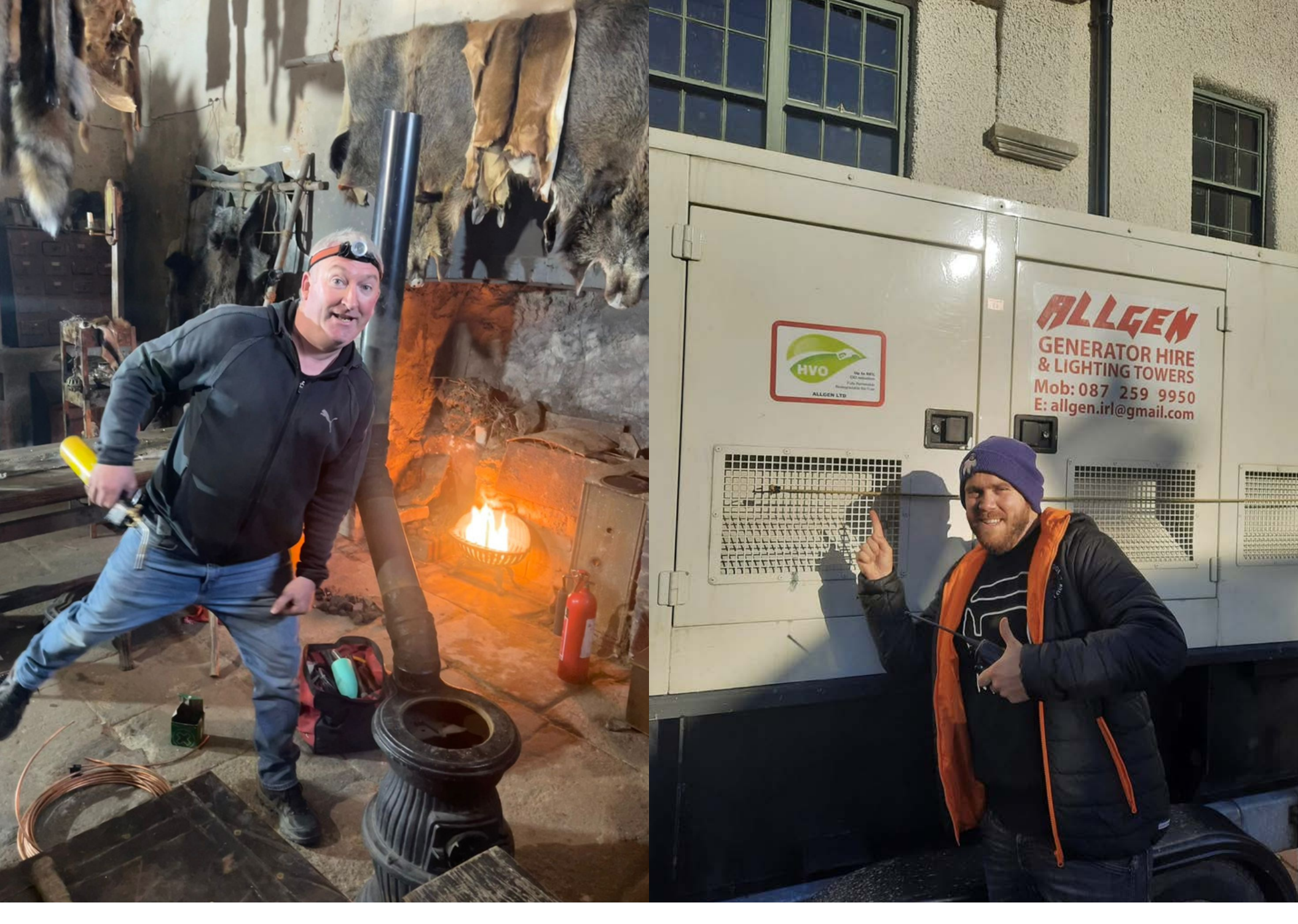
The SFX team used bio gas as a more sustainable fuel. They also used all biodegradable products and water based fluids.