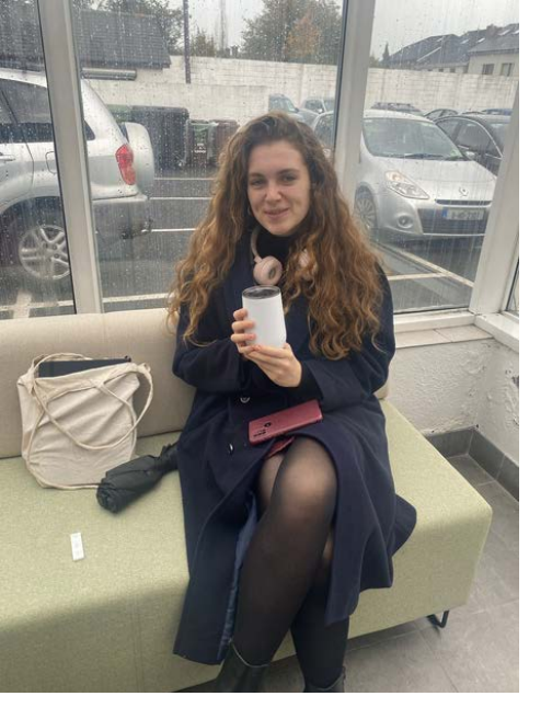
Extras coming prepared!