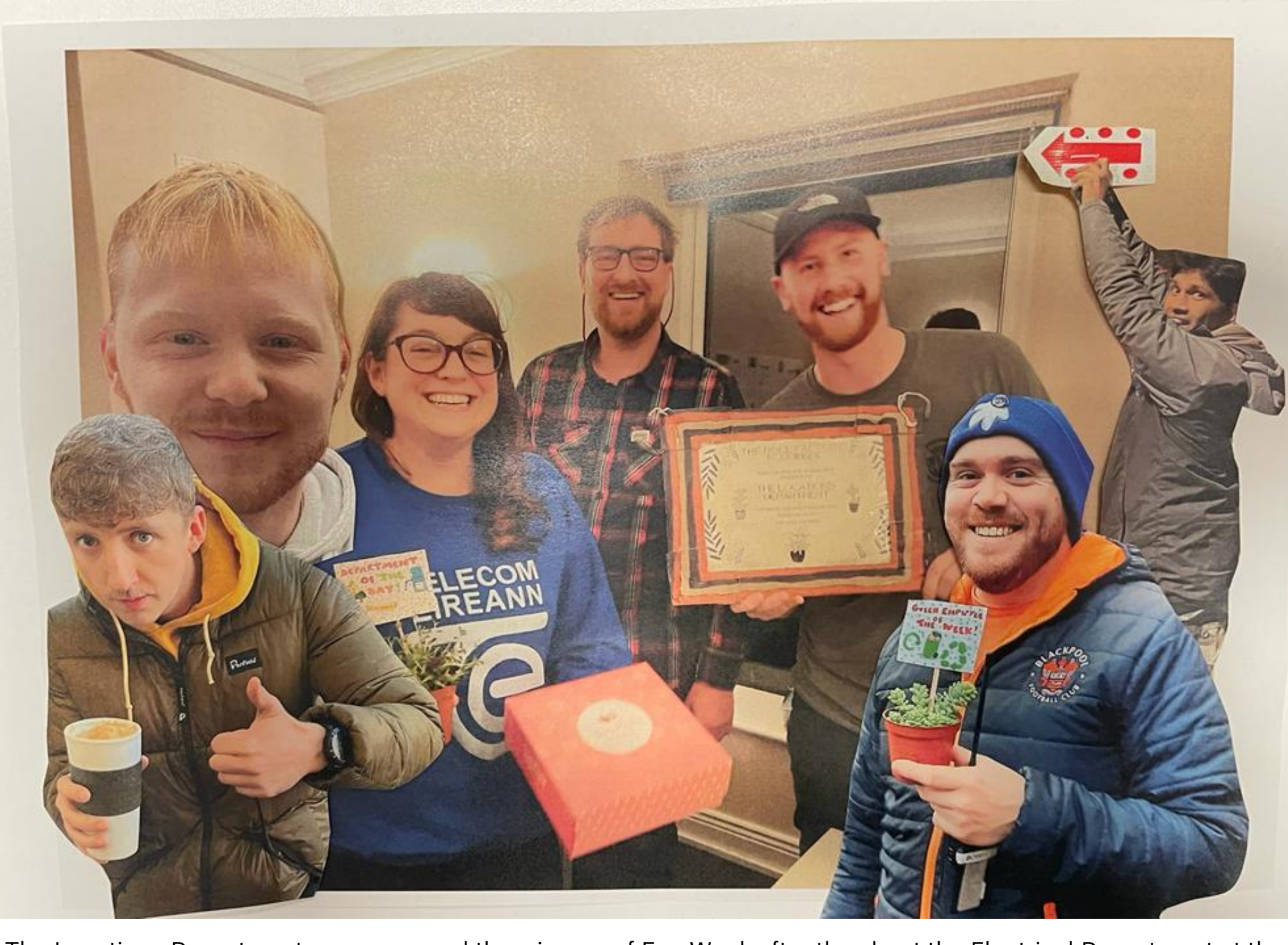
The Locations Department were crowned the winners of Eco Week after they beat the Electrical Department at the last minute!