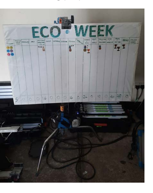
Sparks making a stand for the Eco Board